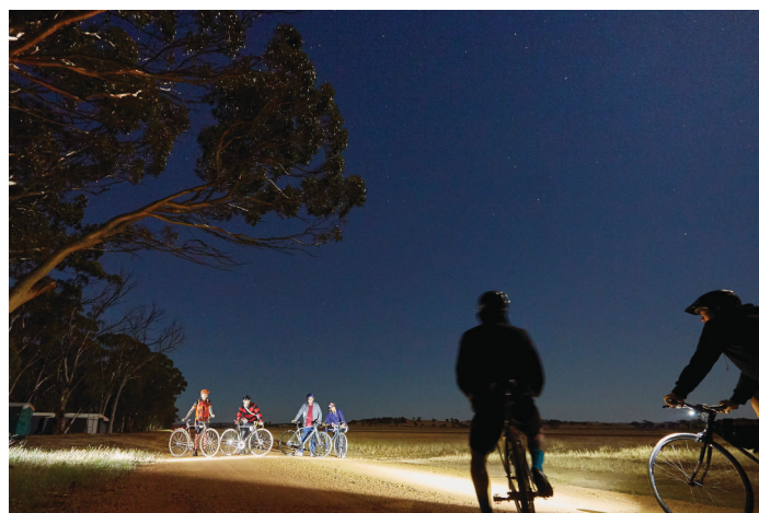
Below: Night riders at the aerodrome.