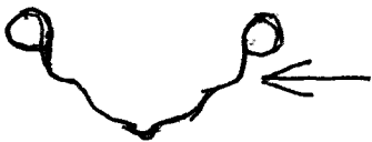
WESTWOOD BEAD SIZE